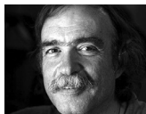
Managing Director Paulo Branco

Alfama Films has its own international sales and distribution services.