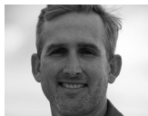
CEO Fabien Westerhoff

In 2022, CONSTELLATION PRODUCTIONS was launched as the company's film and television production house in Paris.